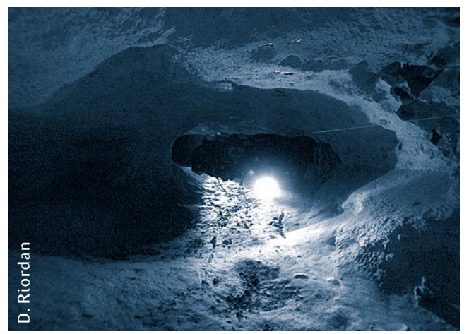
Back referencing is a good habit to get into

It is also a good practice to periodically look back and familiarize yourself with how the environment will look on your return trip. This is known as "back-referencing" and is particularly important at restrictions or other navigational challenges. The exit portion of a dive may present limited visibility, and a mental image of key areas can facilitate an efficient return.