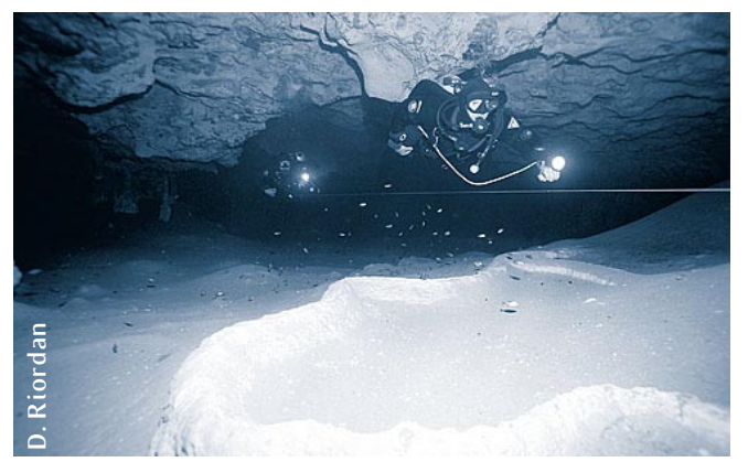
Proper line following is critical when cave diving