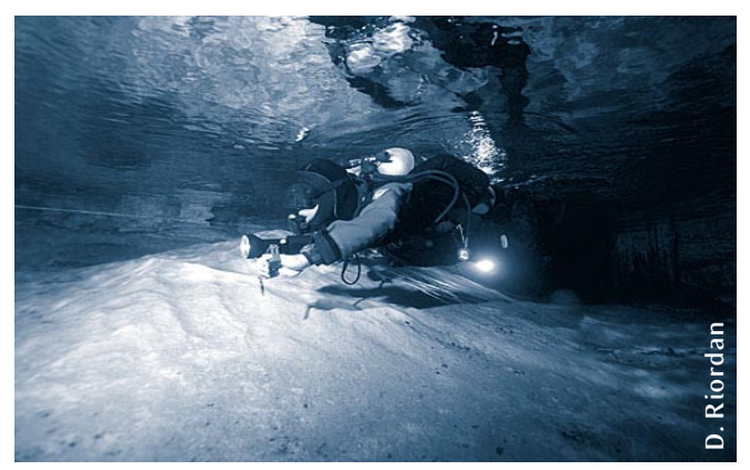
Passive communication is an important component of underwater communication

Passive communication allows team members to constantly monitor each other's state. By keeping their light beams in the field of vision of another team member, individuals are automatically communicating their presence and their general condition.