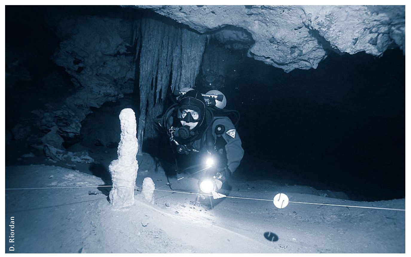
Proper line referencing is a critical component of safe cave diving