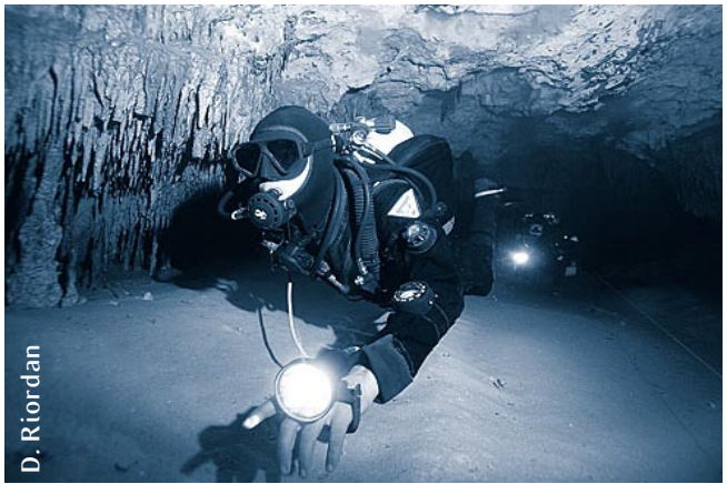
Good buoyancy and trim is essential to cave diving

Proper equipment configuration, coupled with horizontal trim, good buoyancy control and adequate propulsion techniques, are key elements to prevent unnecessary stress on the line. Crossing and positioning oneself under the line could possibly lead to severe entanglement in the manifold assembly, which is by far the worst part of the equipment to get snagged. A prone position ensures effective hydrodynamics and facilitates efficient referencing.