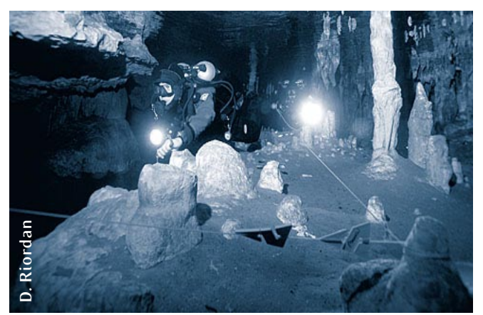
It is important that divers not cut corners

Self-sufficiency is important in building a strong and efficient team, and navigation is an essential part of this. One cannot rely on another team member not to make a mistake. In fact, what makes a proficient team is the ability for each team member to bring forth his or her individual competence and awareness.